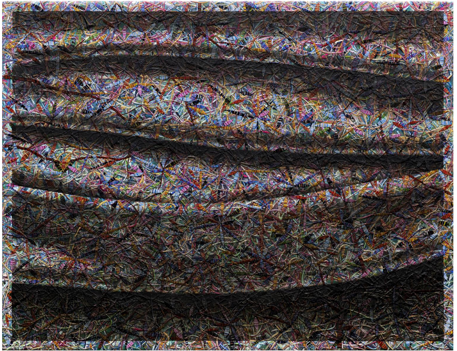
“Música Ligera” (2020), oil on canvas, 35.4 x 45.3 inches