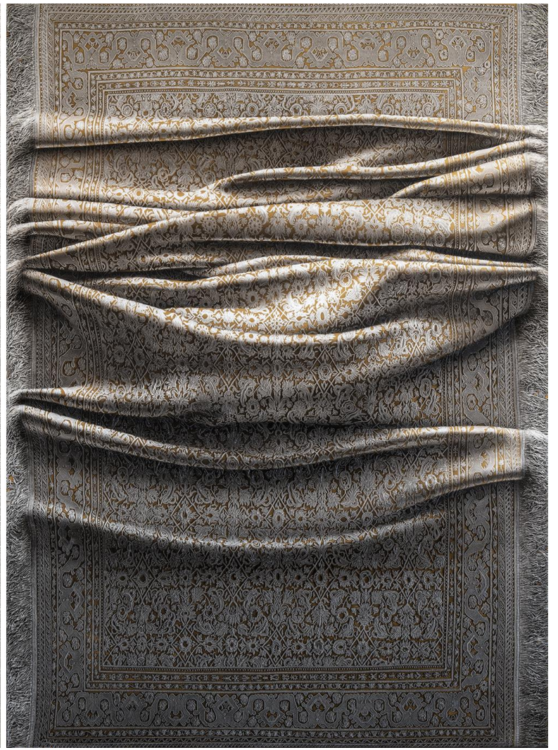
Left: "Toast to Ashes" (2020), oil on canvas, 59 x 84.6 inches. Right: