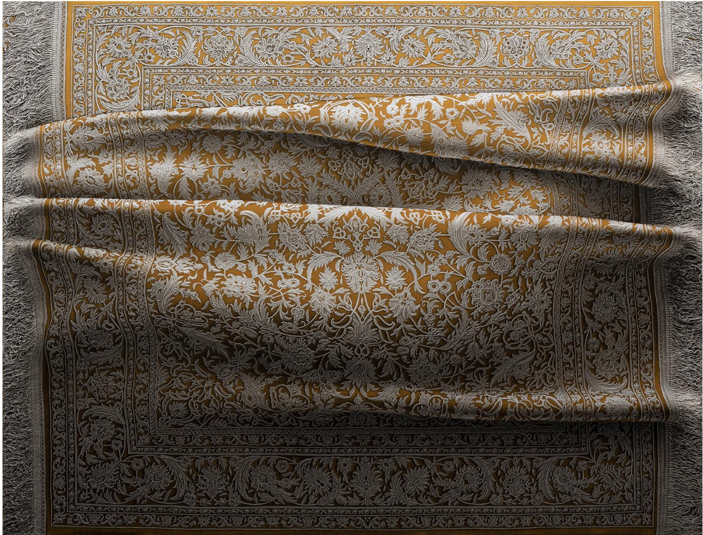
“Elevator Pitch” (2019), oil on canvas, 60 x 78.8 inches

Some of Santín's illusory pieces are on view at the Nassau County Museum of Art in New York, although it currently is closed due to COVID-19 restrictions, and the artist is preparing for a solo show at Galerie ISA in Mumbai in January 2021. To follow his heavily detailed work, head to Instagram .