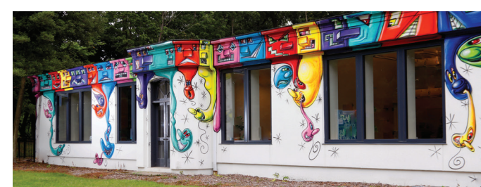
Kenny Scharf, Manes Mural, 2017