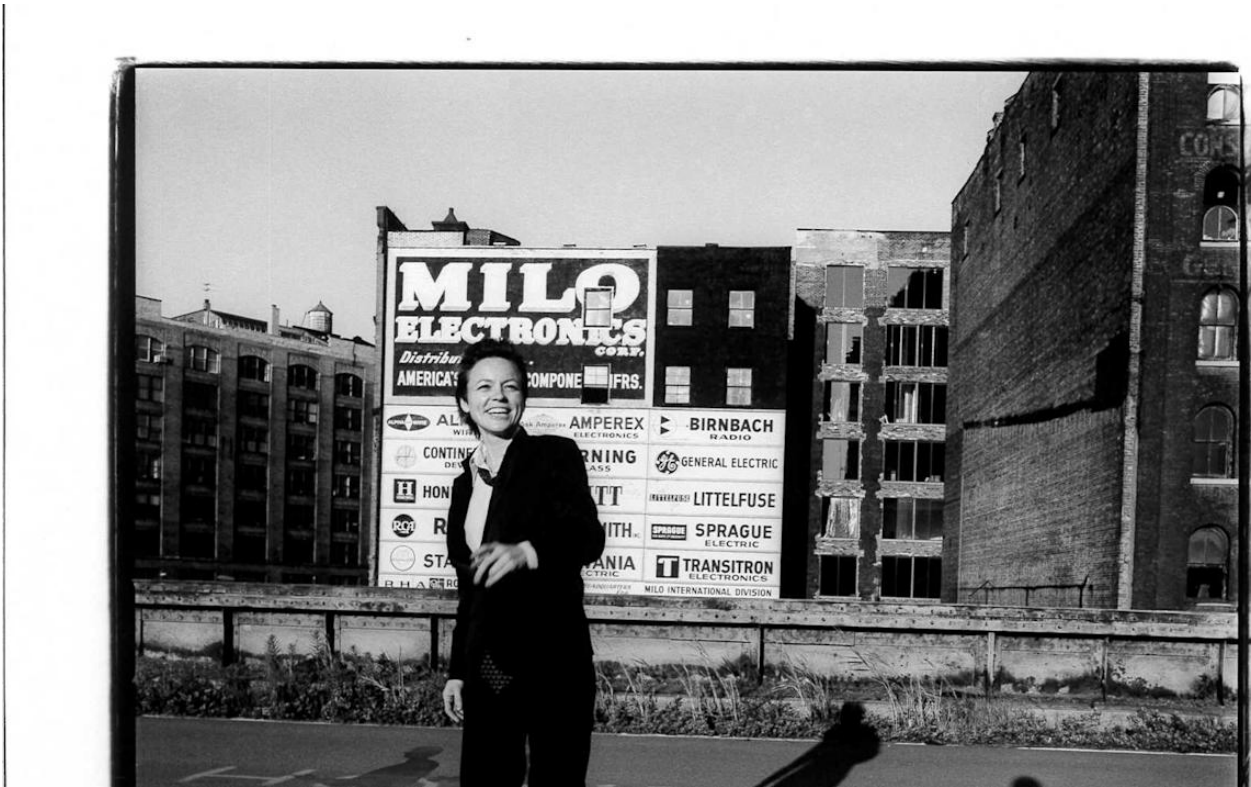
Shigeo Anzai (Japanese, 1939–2020) Laurie Anderson, Artist’s Studio, New York, 1979.1979 negative and print, Gelatin silver print, Bank of America Collection.

The museum said the exhibition is the second loan it has received through Bank of America’s Art in Our Communities program, following the 2021 presentation of “Andy Warhol Portfolios: A Life in Pop | Works from the Bank of America Collection.”