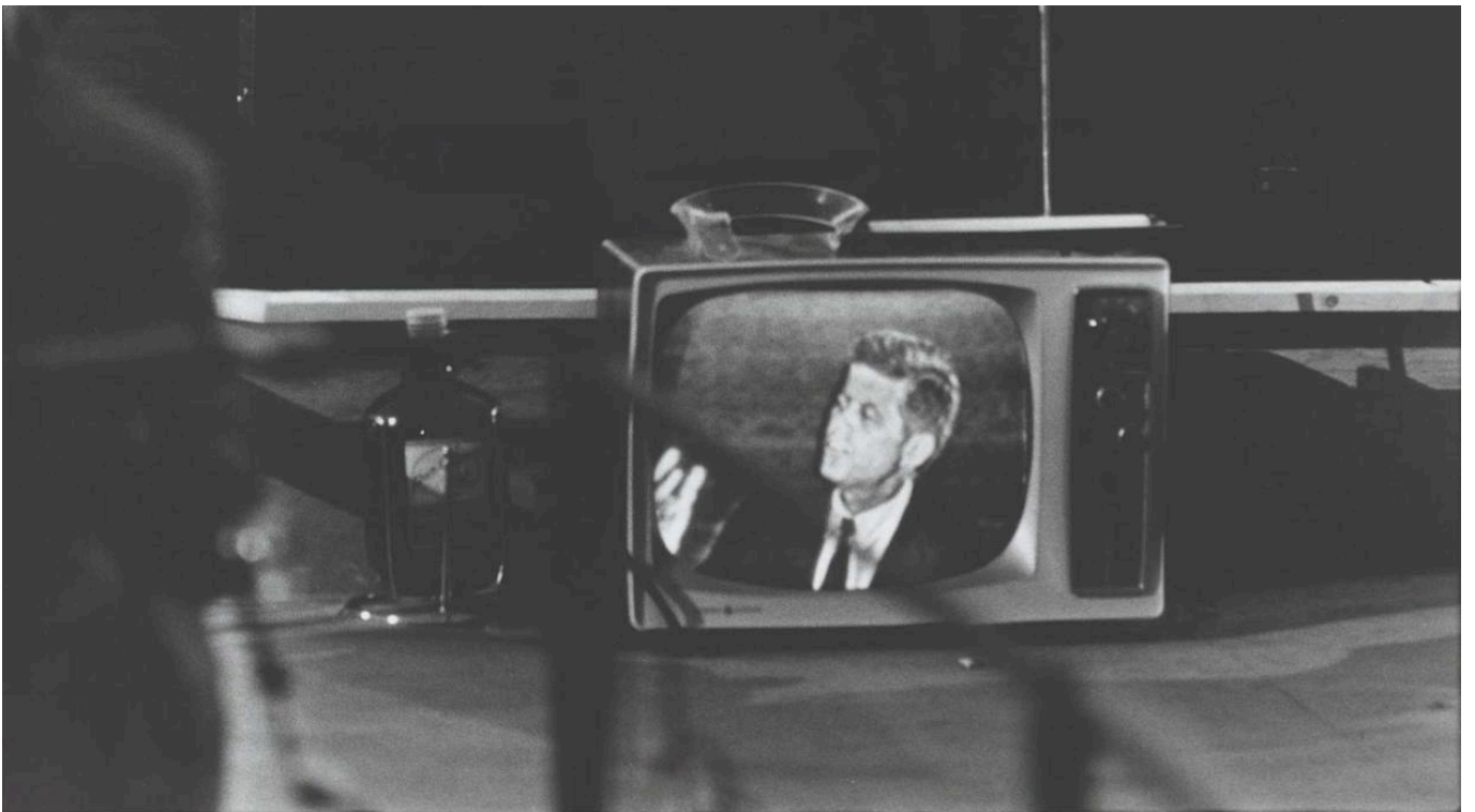
Garry Winogrand (American, 1928–1984), John F. Kennedy, Democratic National Convention, Los Angeles, 1960, from the 15 Big Shots portfolio, 1983. Gelatin silver print, 9/100, Bank of America Collection.

Visitors will find 83 works by 28 portrait photographers, including images by Antony Armstrong-Jones (Lord Snowdon), Richard Avedon, Yousuf Karsh, Gisèle Freund, Berenice Abbott, Imogen Cunningham, and Garry Winogrand, among others. The exhibition also traces how portrait photography expanded from earlier reproducible formats like the carte de visite to iconic images that helped build, challenge, or recast public reputations.